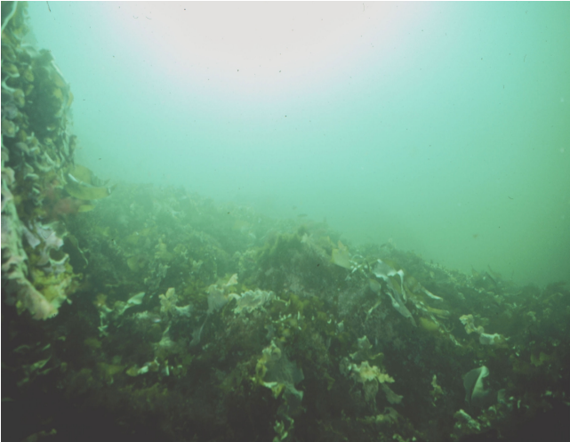
Fig. 2: Kelp beds provide an ideal habitat for a diverse flora and fauna.

grow at 30 m which is as much as 11 m deeper than in the coastal areas. The vegetation is characterised by distinct zoning. Extensive areas at depths between 12 – 20 m are dominated by the brown canopy-forming algae Kelp, Laminaria hyperborea . 61% of the studied area in this depth interval consists of kelp, which is instrumental for habitat diversity. Kelp beds provide a 3-dimensional structure of different habitat types, supporting a diverse flora and fauna for all or part of their life cycle. Kelp beds for example provide an ideal habitat for filamentous algae, bottom-fauna, epi-fauna, fish etc. Closer to the Swedish west-coast, from Gothenburg and further to the south, kelp only occurs sporadically.