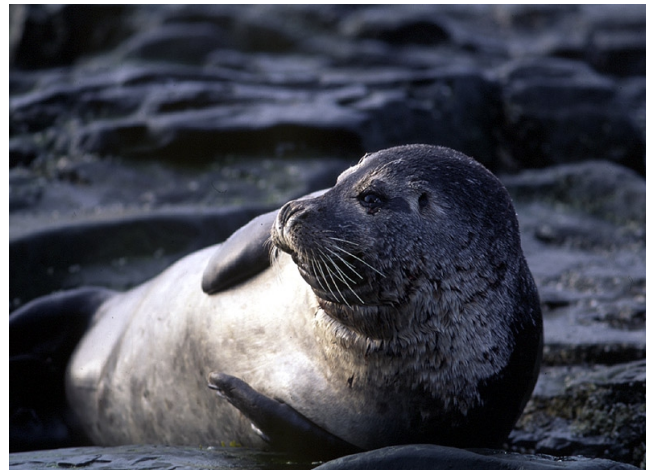
Fig. 3: Fladen is an important feeding ground for the common seal ( Phoca vitulina ).

Moreover, the area is an important feeding ground for the common seal ( Phoca vitulina ) and the grey seal ( Halichoerus grypus ).