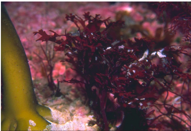
Fig. 4: The vegetation in more shallow areas is dominated by a high diversity of red algae. The picture shows the red algae Phyllophora sp.

There is little documentation as to whether sediment extraction and fisheries (bottom trawling and drift net fishing) have damaged the marine ecosystem so far. However, both activities bear the potential to destroy the site if carried out unsustainably. The macroalgal community currently seems to be intact. In order to ensure a sustainable use of the area, the commercial activities should be carefully surveyed and not expanded.