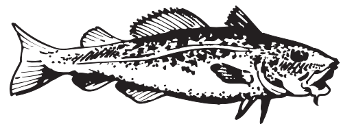
Fig. 2: Gadus morhua

The hydrography is complicated, especially at depths beyond 500 m. The water masses in the area of the bank comprise both cold and dense bottom water from the Norwegian Sea flowing Northwest-wards on the Eastern flank of the bank through the Faroe Bank Channel into the North Atlantic, and warmer Atlantic water on the Southern side of the bank. The surface water of the bank is solely of Atlantic origin and flows in an anticyclonic circulation above the bank creating a retention area whereof the degree of isolation varies with time. The sediment of the bank mainly consists of shell and gravel sand with spots of seabed and stone rock and larger areas of soft bottom on the Southern margin of the bank.